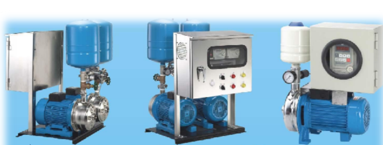
★ Inverter Booster System available on Request